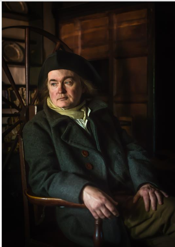
Beamish Trophy - 1st Place - Man by Window