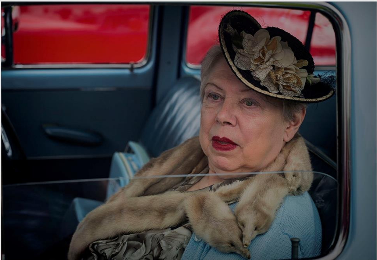
Pretty in Mink by D. Hopper of Durham PS

For Information: The following came 3 rd , 2 nd and 1 st in this last year's Beamish Competition, which give a very good indication on the type of photo opportunities available.