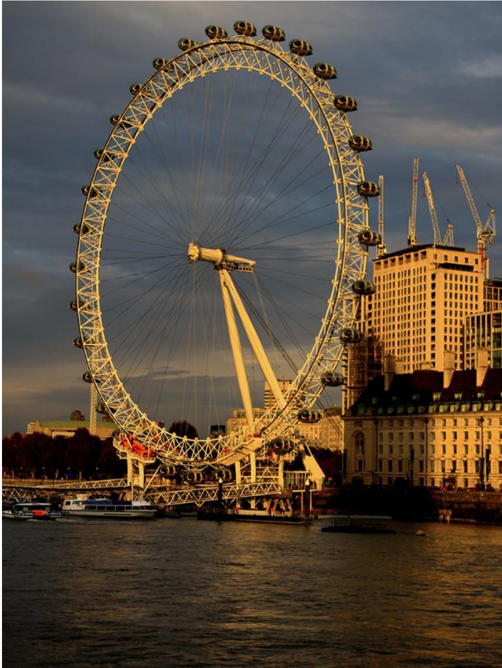
Figure 5 HC Evening Light London Eye-Keith Kirkland.