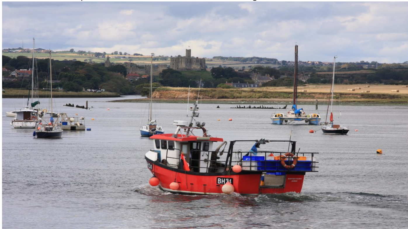
Figure 6 HC Homeward Bound-Ian Morland.