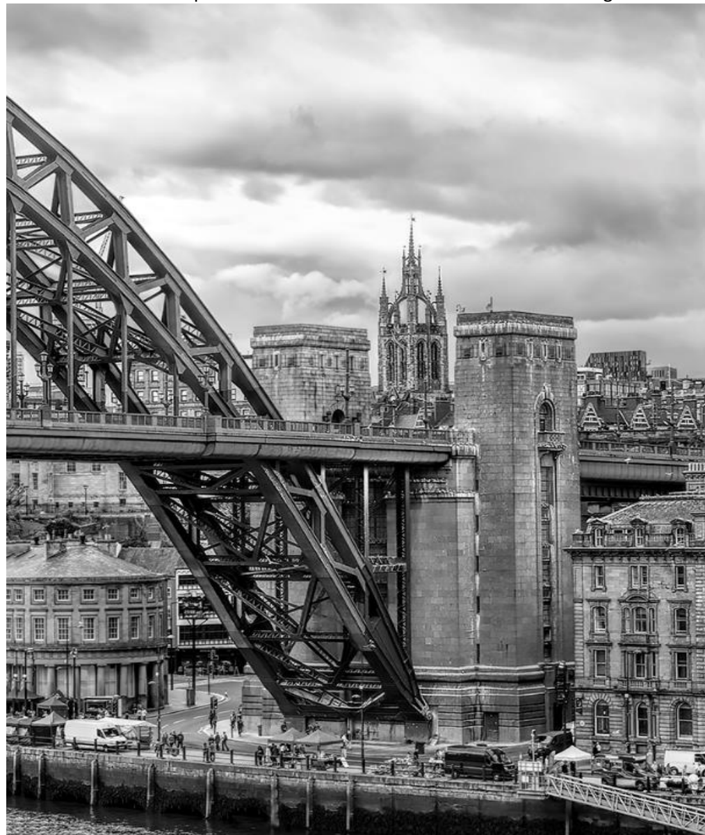
Figure 8 HC St Nicholas Cathedral-Kevin Morgan.

Competitions, Competitions, Competitions – WPC need your Best Photographs.