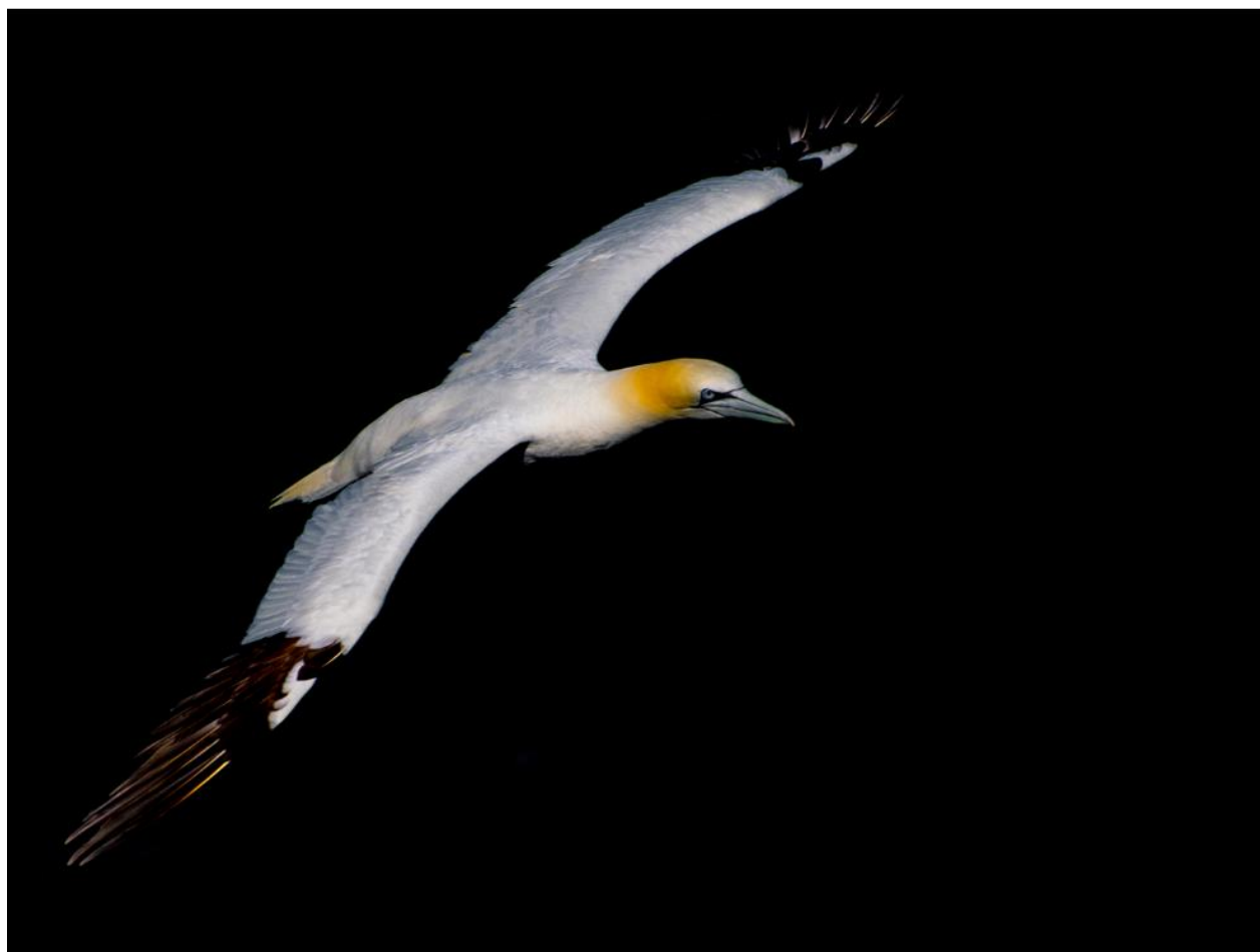
Figure 4 Jane Black Trophy (Beginners) PDI. "Gannet in Flight" by Alexander Permain. 3 rd placed