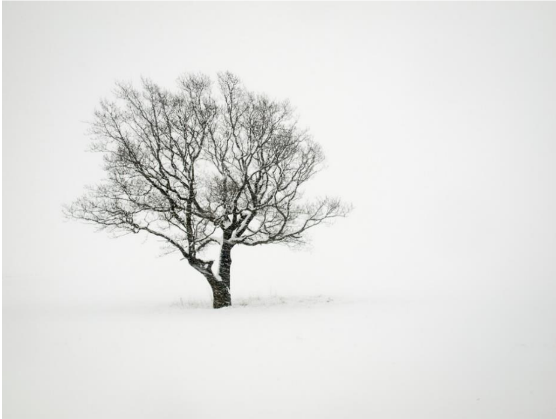
Gerben van Dijk: Webmaster (who wants your portfolios sent to him) Image taken almost from his door during “Beast from the East” weather.