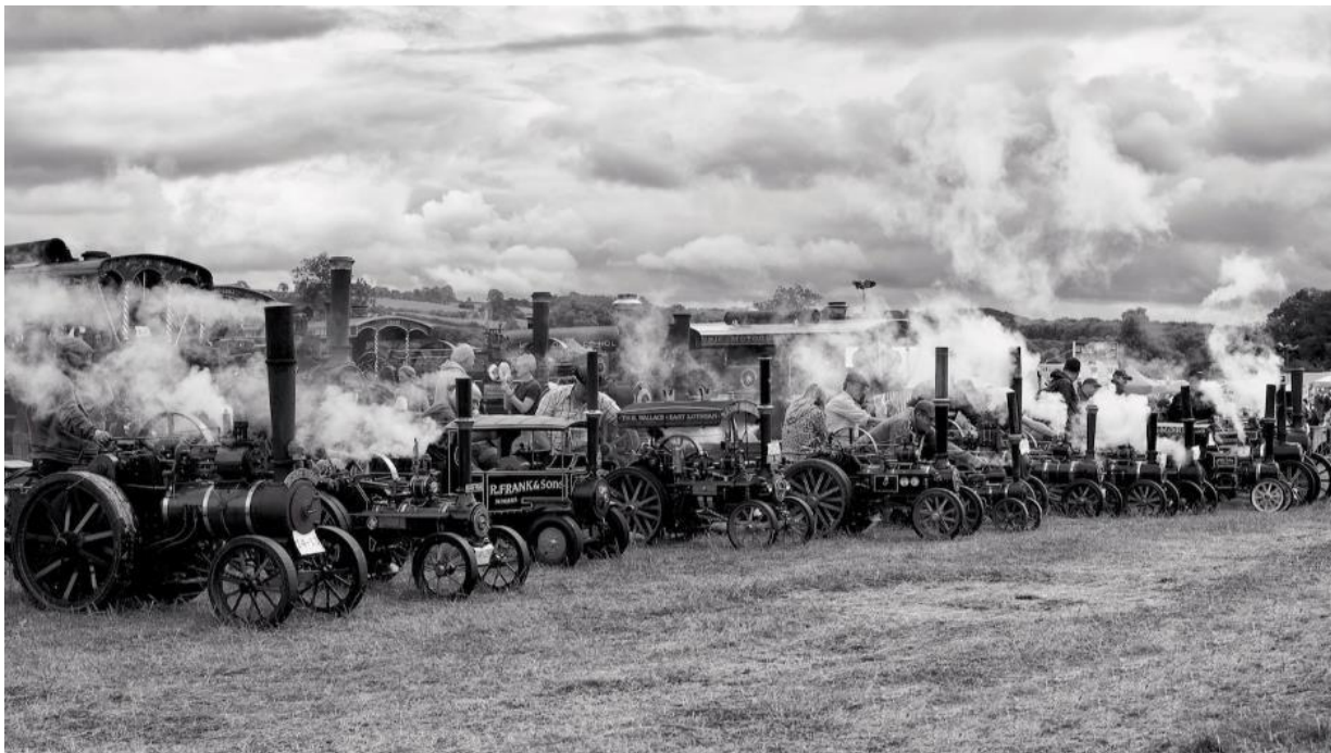
Sue Hingley: Committee including name badges, raffle and many other bits of essential work. Has many favourites, but this one of Masham Steam Fair with the steam tractors all blowing their whistles and “letting off Steam” in a powerful image bringing back sights, sounds, smells and memories of the day.